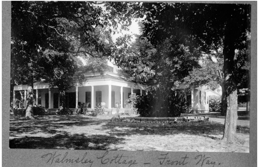
Walmsley Cottage - Front View. 533 East Scenic. From the Deckler Photones Album recently donated to the Historical Society.