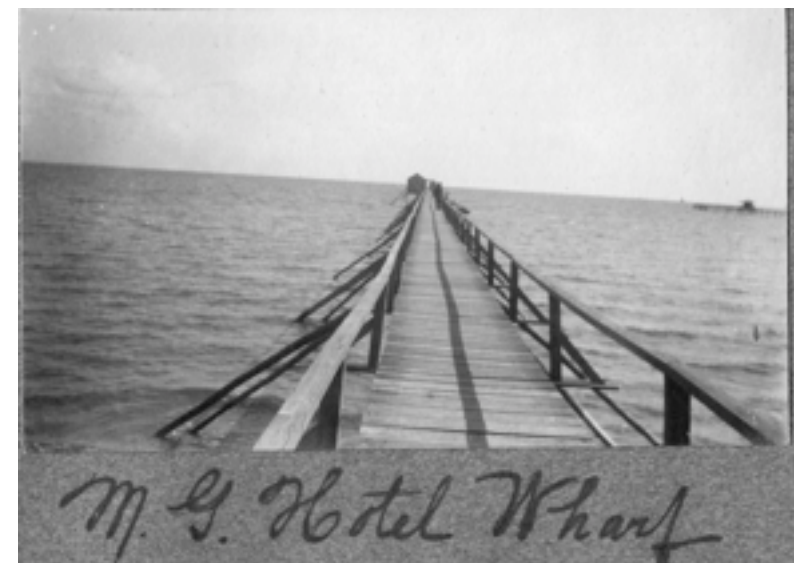
M. G. Hotel Wharf