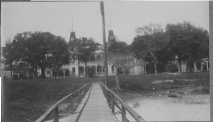
Mexican Gulf Hotel