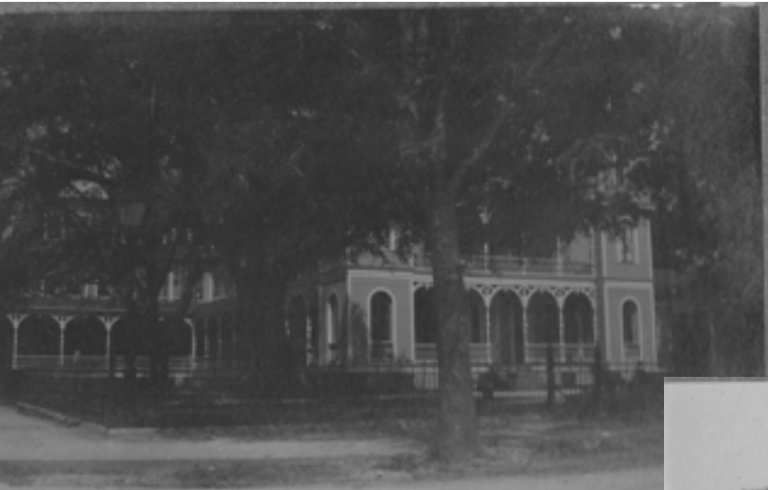
Mexican Gulf Hotel